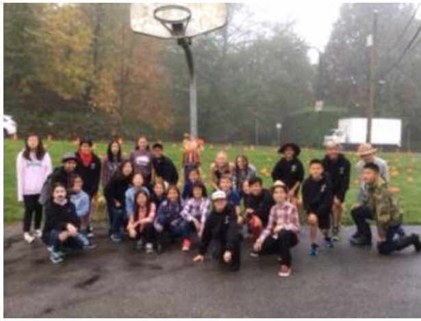
Grade 7 Leadership Group